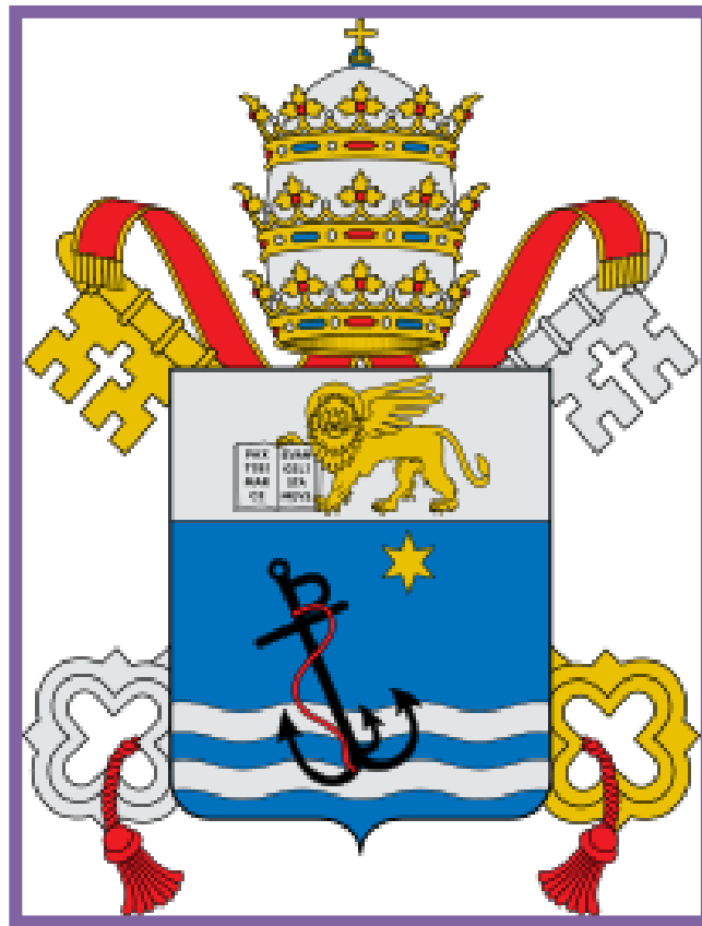
Coat of arms of Pope Pius X

The top part of the shield shows the arms of the Patriarch of Venice, which Pius X was from 1893 to 1903. It consists of the Lion of Saint Mark proper and haloed in silver upon a silver-white background, displaying a book with the inscription of the motto of Venice. Pax tibi Marce Evangelista Meus is Latin for Peace to you, Mark, my evangelist . The shield displays the arms Pius X took as Bishop of Mantua: an anchor proper cast into a stormy sea (the blue and silver wavy lines), lit up by a single six-pointed star of gold. These were inspired by Hebrews 6:19, which states that the hope we have is the sure and steadfast anchor of the soul.