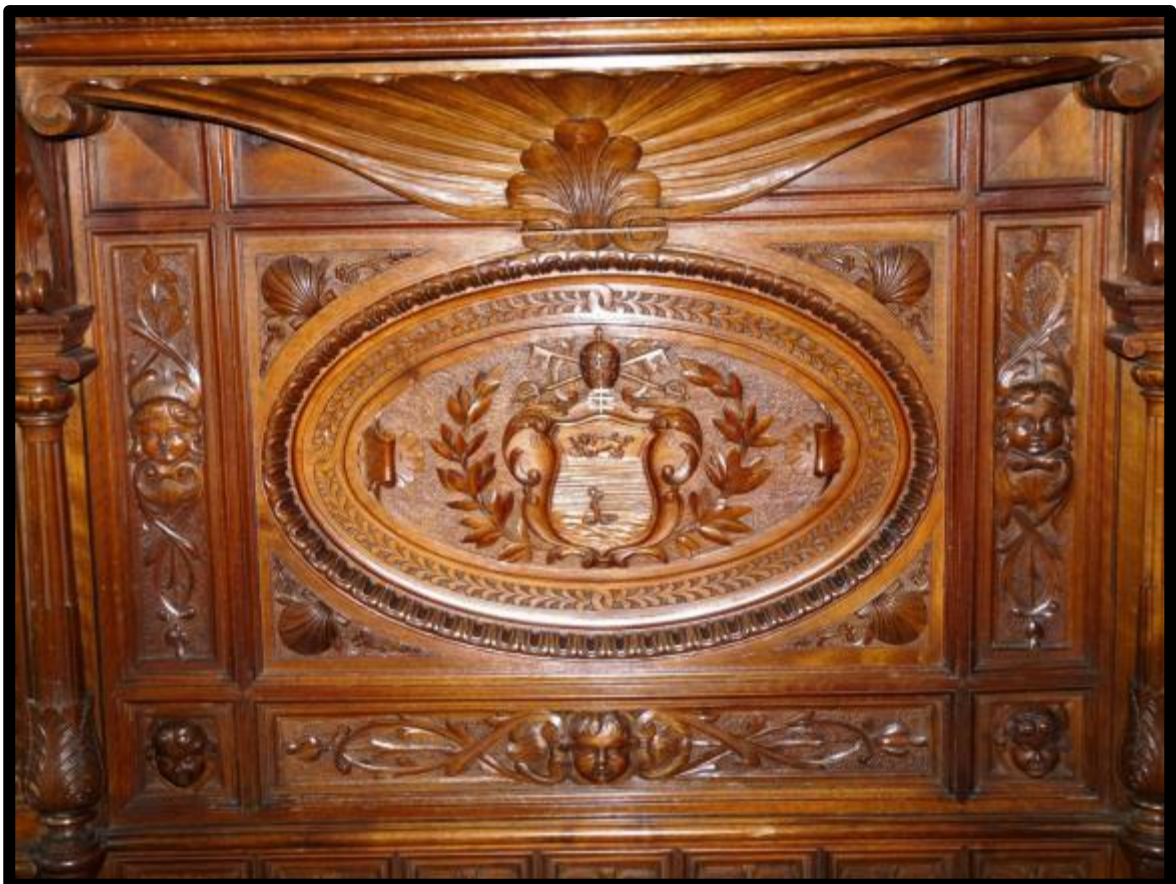
Detail of the front