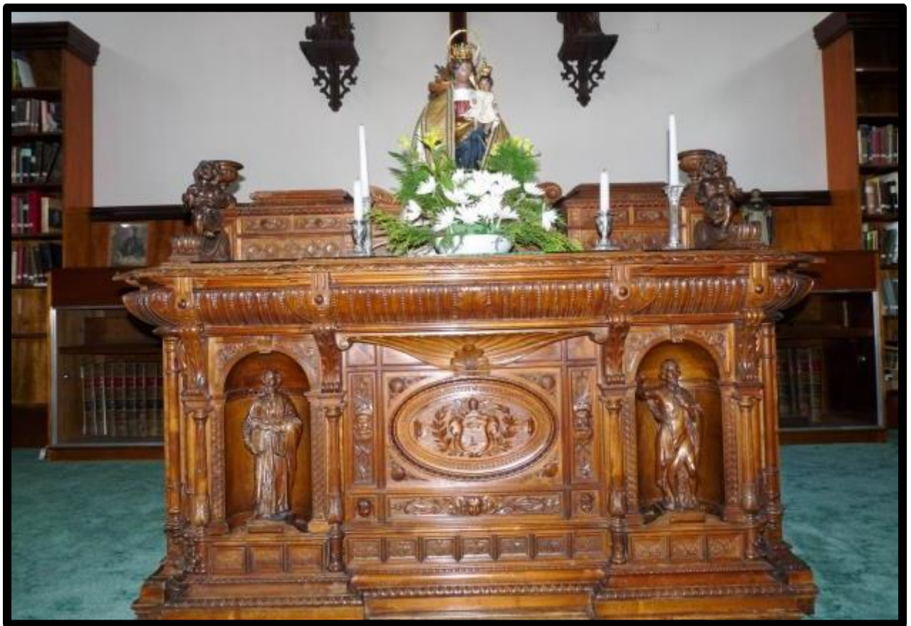
The desk of Pope St Pius X held at the Dominican Convent Stone, Staffordshire as are the relics.